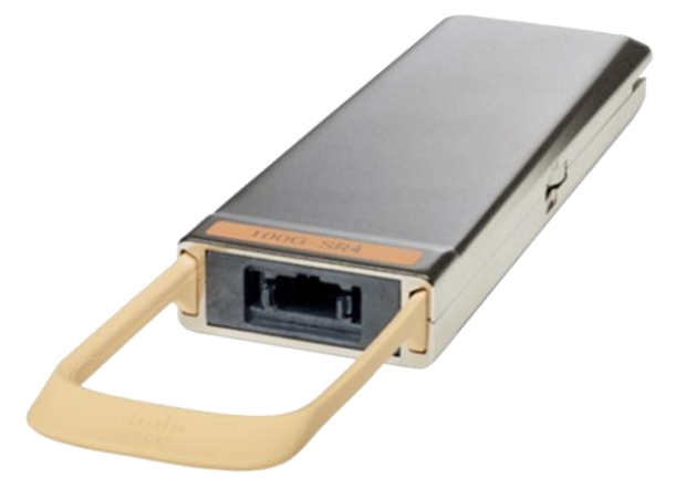
Figure 8. Cisco CPAK-100G-SR4 Module

The Cisco CPAK-100G-SR4 Module supports link lengths of up to 70m (100m) over OM3 (OM4) Multimode Fiber with MPO connectors. It primarily enables high-bandwidth 100G optical links over 12-fiber parallel fiber terminated with MPO multifiber connectors. CPAK-100GE-SR4 supports 100GBase Ethernet rate.