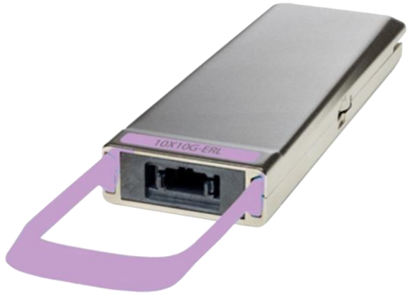
Figure 7. Cisco CPAK-10X10G-ERL Module

The Cisco CPAK-10X10G-ERL module is used in 10 x 10Gb mode along with ribbon-to-duplex SMF breakout cables for connectivity to ten 10GBASE-ER optical interfaces. It supports link lengths up to 25km over standard SMF, G.652. The module delivers 100Gbps links over 24-fiber ribbon cables terminated with MPO/MTP connectors.