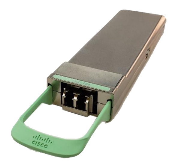
Figure 11. Cisco CPAK-100G-FR Module

The Cisco CPAK-100G-FR Module supports link lengths of up to 2 km over a standard pair of G.652 Single-Mode Fiber (SMF) with duplex LC connectors. The 100 Gigabit Ethernet optical signal is carried over a single wavelength using a PAM4 (Pulse-Amplitude Modulation 4-Level) modulation scheme.