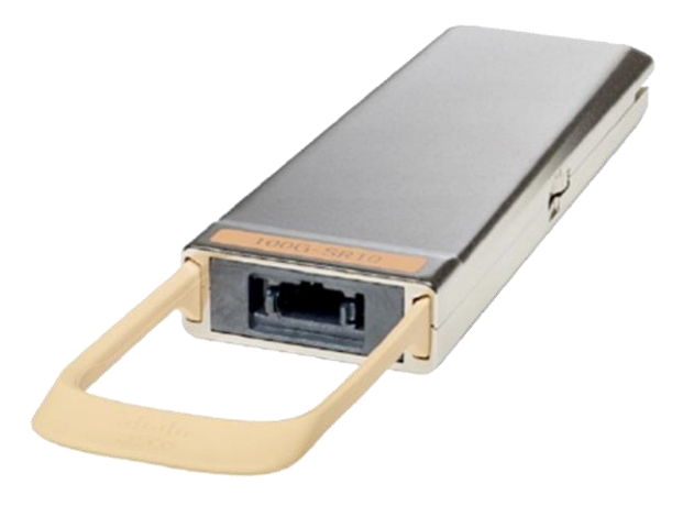
Figure 6. Cisco CPAK-100G-SR10 Module

The Cisco CPAK-100G-SR10 module delivers 100-Gbps links over 24-fiber ribbon cables terminated with MPO/MTP connectors. It can also be used in 10 x 10Gb mode along with ribbon-to-duplex-fiber breakout cables for connectivity to ten 10GBASE-SR optical interfaces. It supports link lengths of 100m and 150m on laser-optimized OM3 and OM4 multifiber cables, respectively.