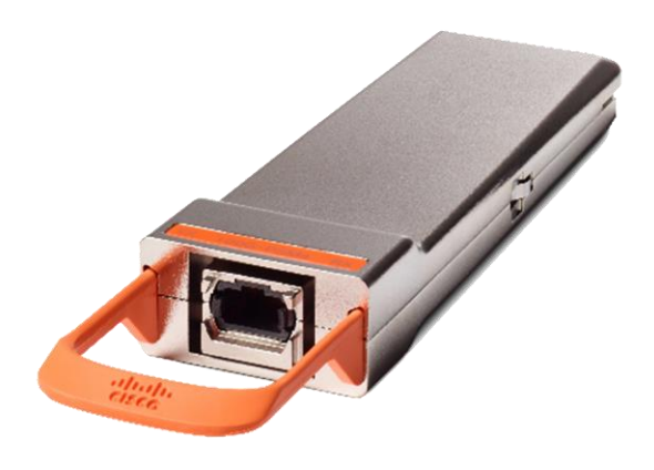
Figure 10. Cisco CPAK-100G-PSM4 Module

The Cisco CPAK-100G-PSM4 Module supports link lengths of up to 500 meters over Single-Mode Fiber (SMF) with MPO connectors. The 100 Gigabit Ethernet signal is carried over 12-fiber parallel fiber terminated with MPO multifiber connectors.