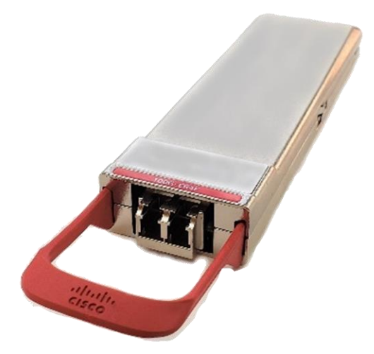
Figure 4. Cisco CPAK-100G-ER4F Module with LC connectors