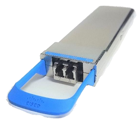
Figure 2. Cisco CPAK-100GE-LR4 Module with LC Connectors