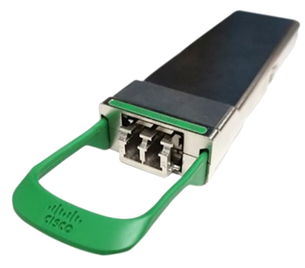
Figure 9. Cisco CPAK-100G-CWDM4 Module

The Cisco CPAK-100G-CWDM4 Module supports link lengths of up to 2 km over a standard pair of G.652 Single-Mode Fiber (SMF) with duplex LC connectors. The 100 Gigabit Ethernet signal is carried over four wavelengths. Multiplexing and demultiplexing of the four wavelengths are managed within the device.