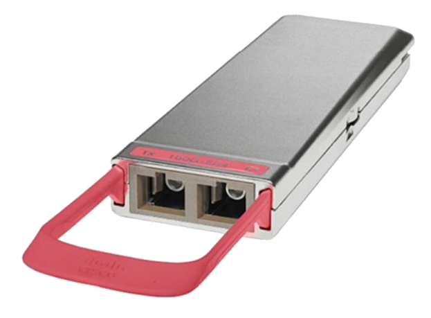
Figure 3. Cisco CPAK-100G-ER4L Module with SC connectors

These ER4 Lite modules are compatible with the 100GBASE-ER4 standard and deliver an aggregate data signal of 100 Gbps, carried over four LAN Wavelength-Division Multiplexing (WDM) wavelengths operating at a nominal 25 Gbps per lane. CPAK-100G-ER4L (no available FEC) supports link lengths up to about 25 km and CPAK-100G-ER4F supports link lengths up to about 30km with FEC disabled and 40km with FEC enabled over standard SMF, G.652. Optical multiplexing and demultiplexing of the four wavelengths are managed within the module.