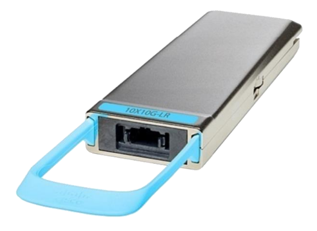
Figure 5. Cisco CPAK-10X10G-LR Module

The Cisco CPAK-10X10G-LR module is used in 10 x 10Gb mode along with ribbon-to-duplex SMF breakout cables for connectivity to ten 10GBASE-LR optical interfaces. It supports link lengths up to 10km over standard SMF, G.652. The module delivers 100-Gbps links over 24-fiber ribbon cables terminated with MPO/MTP connectors.