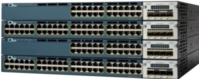
Figure 2. Cisco Catalyst 3560-X Series Switches

Table 2 shows the Cisco Catalyst 3560-X Series configurations.