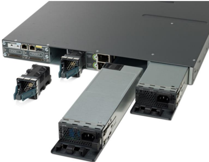
Figure 5. Dual Redundant Power Supplies

Table 6 shows the different power supplies available in these switches and available PoE power.