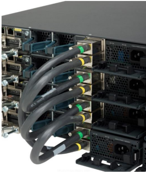
Figure 3. StackPower Connector

StackPower can be deployed in either power sharing mode or redundancy mode. In power sharing mode, the power of all the power supplies in the stack is aggregated and distributed among the switches in the stack. In redundant mode, when the total power budget of the stack is calculated, the wattage of the largest power supply is not included. That power is held in reserve and used to maintain power to switches and attached devices when one power supply fails, enabling the network to operate without interruption. Following the failure of one power supply, the StackPower mode becomes power sharing.