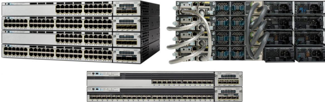
Figure 1. Cisco Catalyst 3750-X Series Switches (Front and Back)

Table 1 shows the Cisco Catalyst 3750-X Series configurations.