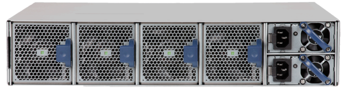
Arista 7050X 2RU Rear View: Rear-to-front airflow model (blue)