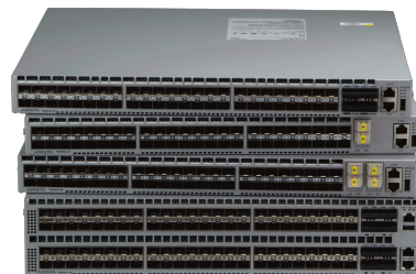
Arista 7050SX Series of 1/10GbE and 10/40GbE Switches Top to bottom: 7050SX-64, 7050SX-72, 7050SX-128, 7050SX-96

Combined with Arista EOS the 7050X Series delivers advanced features for big data, cloud, virtualized and traditional designs.