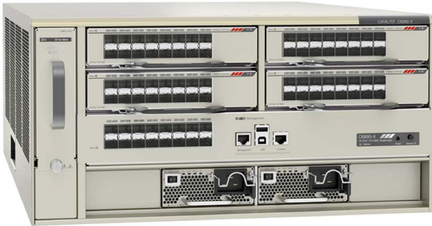
Figure 2. 16-Port Extensible Port Card