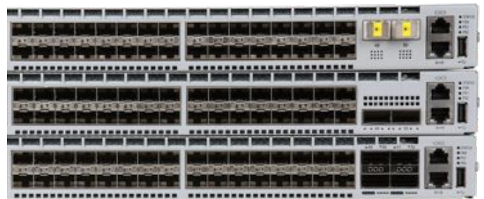
Arista 7280E Flexible Port Combinations

7280SE-64: 4 QSFP+ ports for 4x 40G or 16x10G