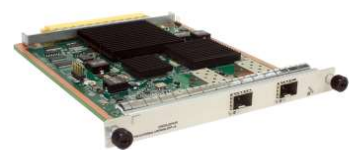
2-Port 10GBase WAN/LAN-SFP+ Flexible Card A