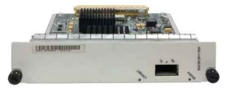
1-Port OC-192c/STM-64c POS-XFP Flexible Card(Occupy two slots)