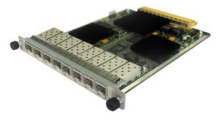
8-Port OC-3c/STM-1c POS-SFP Flexible Card