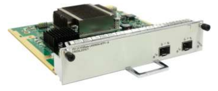
2-Port 10GBase LAN/WAN-SFP+ Flexible Card A(P51-A)