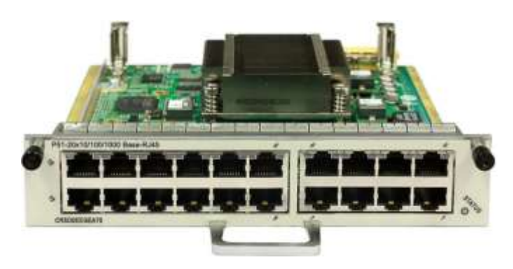
20-Port 10/100/1000Base-RJ45 Flexible Card A(P51-A)