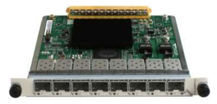
8-Port 100/1000Base-X-SFP Flexible Card A(P10-A,Supporting 1588v2)