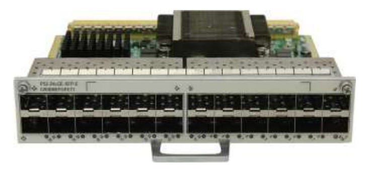
24-Port 1000Base-X-SFP Flexible Card E(P52-E)