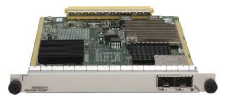
2-Port Channelized STM-1c POS-SFP Flexible Card(P50)