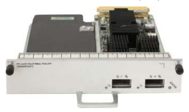
2-Port OC-192c/STM-64c POS-XFP Flexible Card(P51-A)