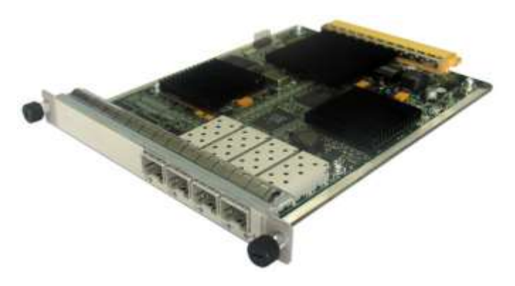
4-Port OC-3c/STM-1c POS-SFP Flexible Card