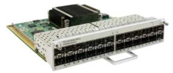
24-Port 100/1000Base-X-SFP Flexible Card A(P51-A)