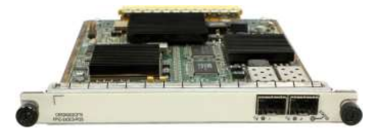
2-Port OC-3c/STM-1c POS-SFP Flexible Card