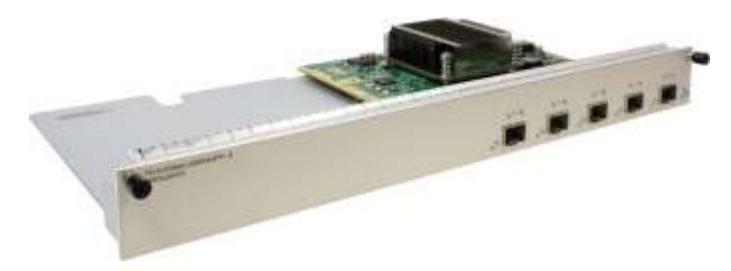
5-Port 10GBase LAN/WAN-SFP+ Flexible Card A(P51-A, Occupy two sub-slots)