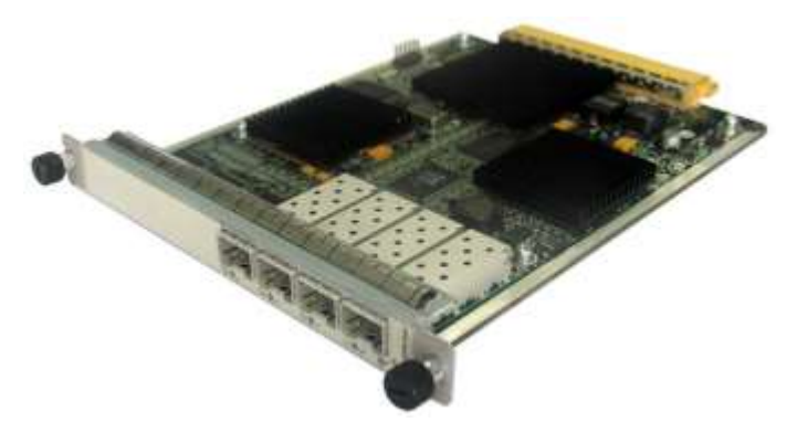
4-Port OC-48c/STM-16c POS-SFP Flexible Card