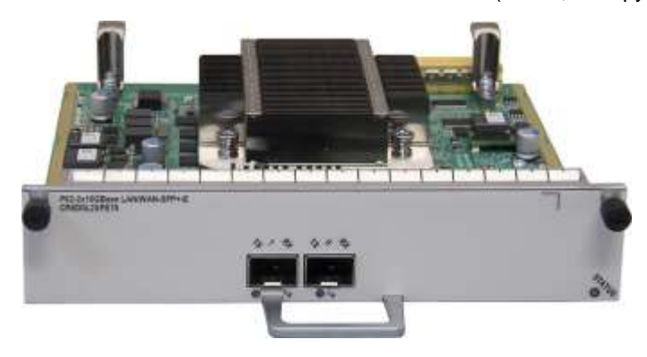
2-Port 10GBase LAN/WAN-SFP+ Flexible Card E(P52-E)