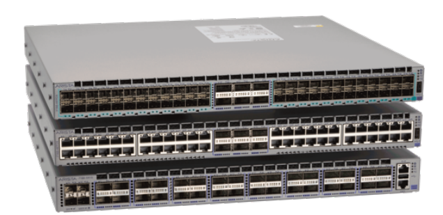
Arista 7160 Series of Data Center Switches

25GbE interfaces with SFP and 100GbE with QSFP on the 7160 Series enables flexible choices of port speed providing unparalleled flexibility and the ability to seamlessly transition data centers to the next generation of Ethernet performance. The 7160 Series provide industry leading power efficiency with airflow choices for back to front, or front to back. Combined with Arista EOS the 7160 Series delivers advanced features for cloud, big data, virtualized and traditional designs.