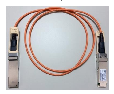
Figure 5. Cisco 40G QSFP active optics cables

Cisco QSFP to QSFP copper direct-attach 40GBASE-CR4 cables (Figure 5) are suitable for very short distances and offer a flexible way to connect within racks and across adjacent racks. Active optical cables are much thinner and lighter than copper cables, which makes cabling easier. Active optical cables enable efficient system airflow and have no EMI issues, which is critical in high-density racks. Cisco currently offers active optical cables in lengths of 1, 2, 3, 5, 7, 10, 15, 20, 25 and 30 meters.