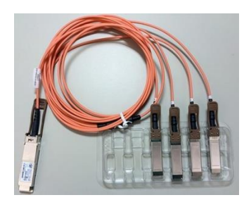
Figure 4. Cisco 40G QSFP to Four SFP+ breakout active optics cables