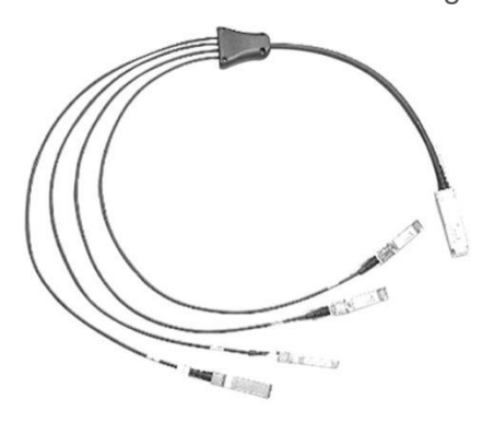
Figure 2. Cisco QSFP to Four SFP+ copper breakout cables

Cisco QSFP to four SFP+ copper direct-attach breakout cables (Figure 2) are suitable for very short distances and offer a very cost-effective way to connect within racks and across adjacent racks. These breakout cables connect to a 40G QSFP port of a Cisco switch on one end and to four 10G SFP+ ports of a Cisco switch on the other end. Cisco currently offers passive cables in lengths of .5, 1, 2, 3, 4 and 5 meters and active cables in lengths of 7 and 10 meters.