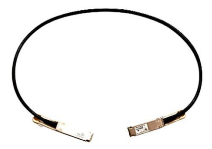
Figure 3. Cisco 40GBASE-CR4 QSFP direct-attach copper cables

Cisco QSFP to QSFP copper direct-attach 40GBASE-CR4 cables (Figure 3) are suitable for very short distances and offer a very cost-effective way to establish a 40-gigabit link between QSFP ports of Cisco switches within racks and across adjacent racks. Cisco currently offers passive cables in lengths of 0.5, 1, 2, 3, 4 and 5 meters and active cables in lengths of 7 and 10 meters.