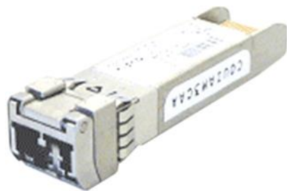
Figure 1. Cisco 10GBASE SFP+ modules

The Cisco® 10GBASE SFP+ modules (Figure 1) give you a wide variety of 10 Gigabit Ethernet connectivity options for data center, enterprise wiring closet, and service provider transport applications.